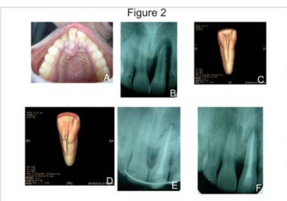
Figure 2-Images of case report 2

Fig 1F-2 year follow-up radiograph showing an intact apical seal and a healthy periradicular area.